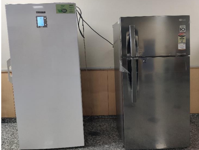
-20°C and Refrigerator