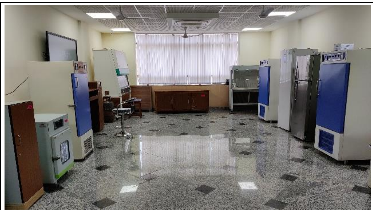
An Overview of the Common Laboratory Facilities at SCHPR