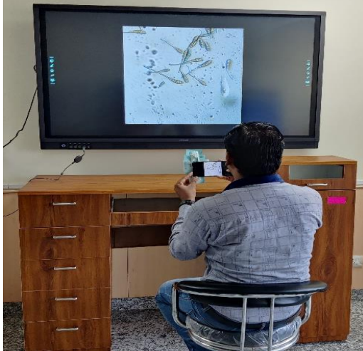
Foldscope microscopy display Unit

Foldscope Demonstration Video available: https://www.youtube.com/watch?v=waWK-f-f28&t=384s