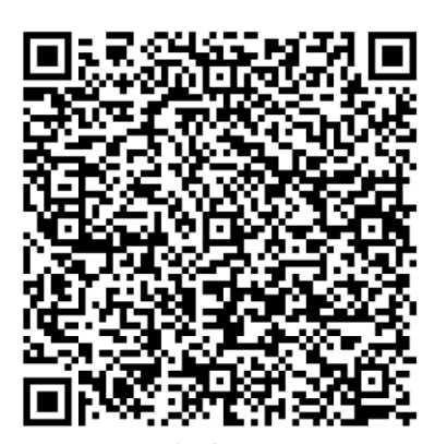
OR Code for Payment