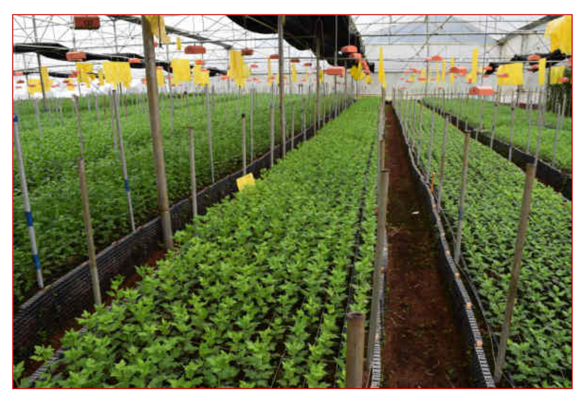
Figure 5. A healthy Chrysanthemum nursery in polyhouse in Nilgiris