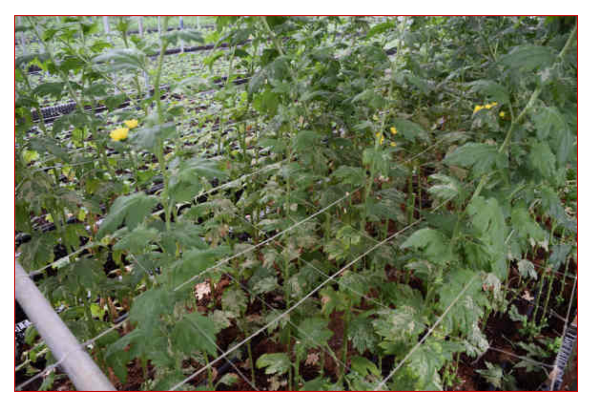
Figure 7. A close view of leaf miner symptoms on Chrysanthemum in a polyhouse in Nilgiris

Figure 6. Leaf miner infestation on Chrysanthemum in a polyhouse in Nilgiris