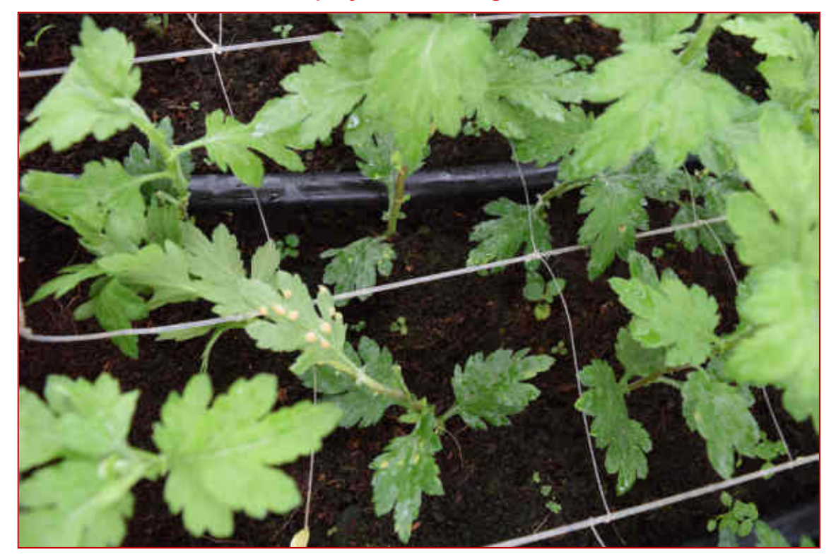
Figure 6. Trace infection of rust caused by Puccinia horiana on Chrysanthemum in a polyhouse in Nilgiris