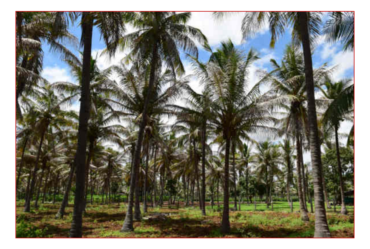
Figure 2: A severely infested coconut orchard

(Location: between Bangalore and Mysore)