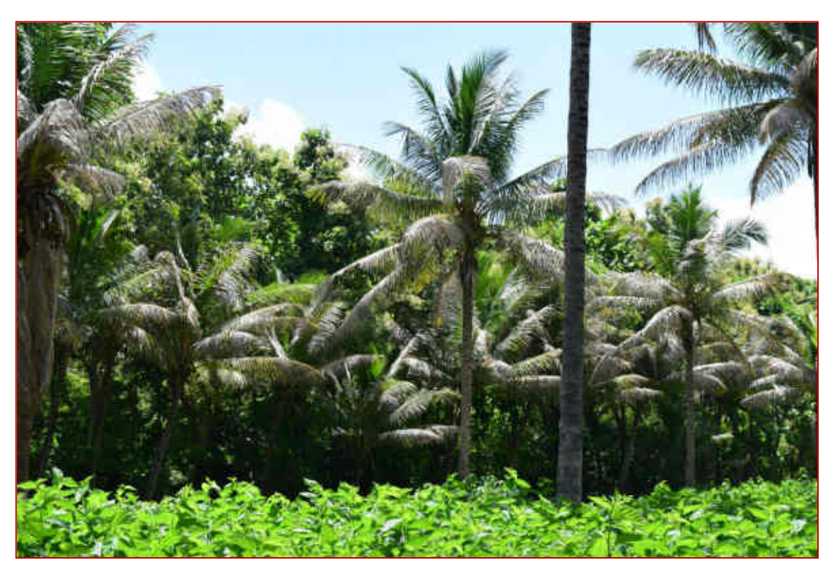
Figure 3. Silvery appearance of white fly infested coconut trees