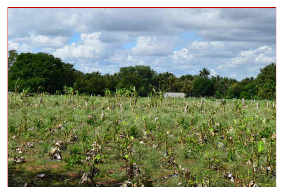
Figure 4 : Defoliated banana orchard near white fly infested coconut orchard